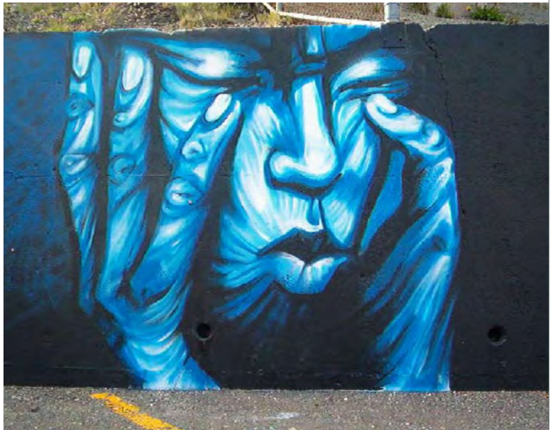
Mural by youth in downtown St. John’s