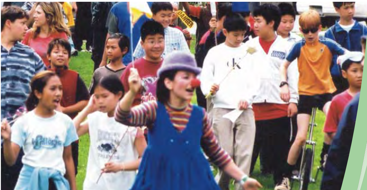
Circus of Dreams, 2001 (Vancouver) Public Dreams Society

Cultural planning is a way of looking at all aspects of a community's cultural life as community assets. Cultural planning considers the increased and diversified benefits these assets could bring to the community in the future, if planned for strategically. Understanding culture and cultural activity as resources for human and community development, rather than merely as cultural "products" to be subsidized because they are good for us, unlocks possibilities of inestimable value. And when our understanding of culture is inclusive and broader than the traditionally Eurocentric vision of "high culture," then we have increased the assets with which we can address civic goals.